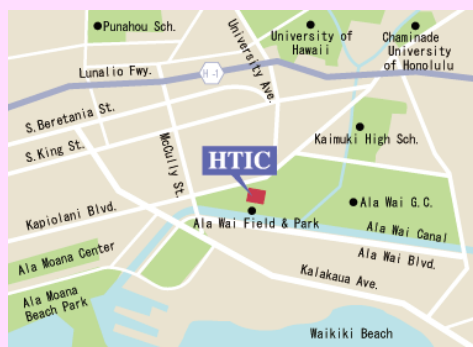
Location of HTIC

ISABMEC2014 is going to be held at HAWAII TOKAI INTERNATIONAL COLLEGE (HTIC) located at 2241 Kapiolani Boulevard, Honolulu, Hawaii 96826, U. S. A.